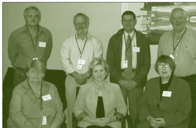
▲ Participants in the recent focus group meet to discuss and evaluate the information provided to accompany the CPI increase.

Prior to publishing each issue of the Pension Update we conduct a focus group to ensure the publication best meets your needs. Members of the focus group are drawn from the readership and discuss the newsletter, its stories and style, and any other publications or information accompanying the CPI increase. This process allows us to stay in touch with your needs and interests, and deliver the best possible service to support you in your retirement. If you have any comments or suggestions about the Pension Update email pensions@dfrdb.gov.au or phone 1300 001 877 .