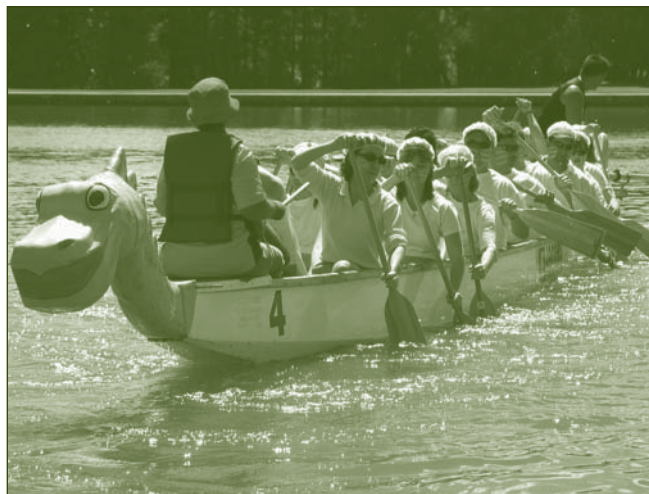
▲ Staff from ComSuper competing in the annual Dragons Abreast dragon boat race on Lake Burly Griffin, to raise money for breast cancer research and education.

We need seven days notice before the pension payday to make a change to your bank account details. For example, if you changed your bank account and you wanted it to take effect on payday 19 January 2006 , you would need to tell us no later than 13 January 2006 . But, whatever you do, don't close your existing account until your payments start going into your new account.